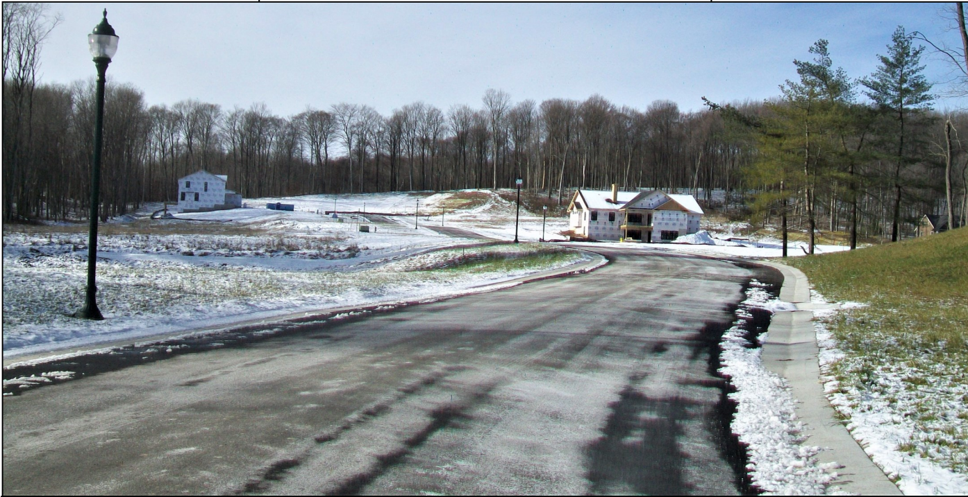
Two new houses being built December 2022.