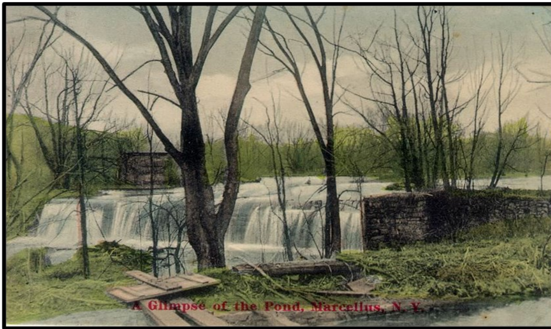
A Glimpse of the Pond, Marcellus, N. Y.