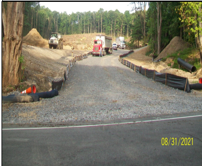
New road between Hall Ave and Platt Road off of South street to Baltimore Ridge.