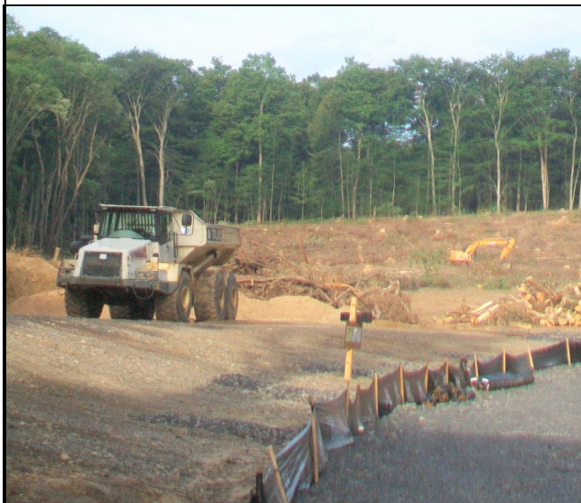
Clearing of the land for Baltimore Ridge housing in the Village of Marcellus.