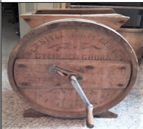
The picture to the left is a butter churn made between 1850 and 1899. Sears & Roebuck sold the butter