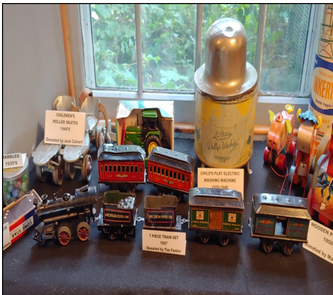
The above picture shows the American Flyer #12 that we just received from the Fenlon family.