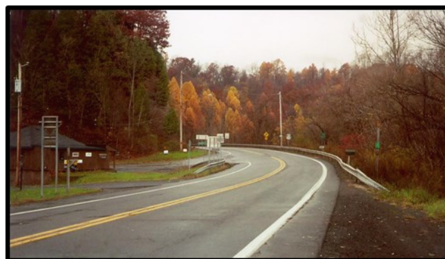
The Marcellus Observer – April 9, 1959

Marcellus Fables - True or False: I have always heard that there used to be an entrance to underground caves some where along the gorge road. I also heard that it was sealed off when someone determined it was too dangerous for people to enter. Anyone know anything about that?