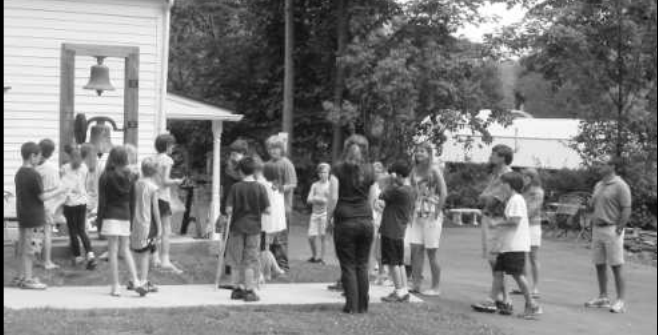
Marcellus School Students Tour the Steadman House