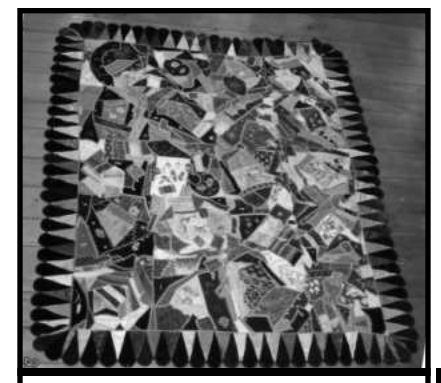
1885 Crazy Quilt given by Grace Flock