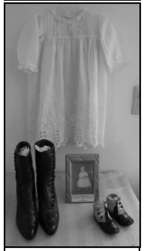
Dress, Shoes and picture given by Sheila Schweitzer

You will find something different every time you visit the Steadman House!