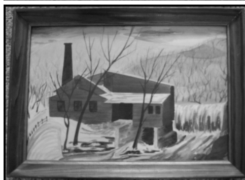
Wilbur Hoyt Paintings