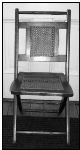
Jones & Uttley Chair