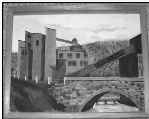
A.V. Smith Barley Mill