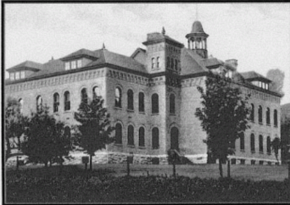
West Hill School

Marcellus Union School District was organized in 1891 by consolidating District #8 on East Hill and District #2 of Skaneateles on West Hill with District #2 in the village. The West Hill School on West Main Street was built in 1892 at a cost of $14,375. It was formally opened on December 3, 1892 with Matthew I. Hunt as principal and was recognized by the State Department of Education the following year.