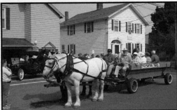
Bruce Widger with the first of four wagon tours.