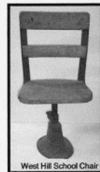
West Hill School Chair

Under the National Industrial Recovery Act of 1933 the district received a grant for $238,500 to build a new school. The corner stone was laid on September 13, 1936 and the building opened in the fall of 1937, housing students from kindergarten thru twelfth grade. Today this school is the Driver Middle School and the campus has enlarged to Heffernan Elementary and the Senior High School.