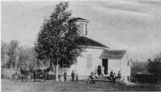
The District 9 Octagon Schoolhouse around 1900.